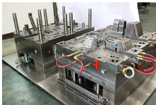
Car Air Cleaner Mold